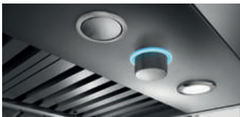
IN/OUT Backlit Knob

Available in 30" and 36" widths and only 10" high, the Cervinia is a streamlined version of the full-size Calabria model. This hood features professional styling, seamless welded corner craftsmanship, a powerful 600 CFM blower with high airflow, heavy duty stainless steel baffle grease filters, Replaceable LED lighting, plus backlit hidden metallic in/out knobs for convenience and safety. Cervinia also delivers higher efficiency and easy maintenance for a cleaner kitchen.