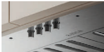
stainless steel push button controls

Palermo provides professional grade performance, while its 28 1/4" width and 10 3/4" depth enables it to be discreetly installed within standard 12" deep cabinetry, making it ideal for smaller kitchens or where the range hood needs to be out of sight. Palermo has a powerful 600 CFM blower to support most cooking needs. Stylish stainless steel push button controls operate a 3-speed blower and LED lighting.