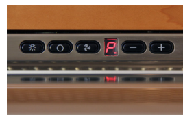
Electronic Push Button Controls