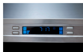
Multi-function electronic controls with LCD display