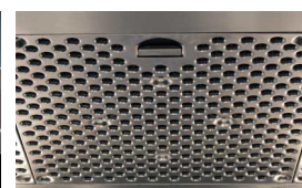
Stainless Steel Micro Hole Filters