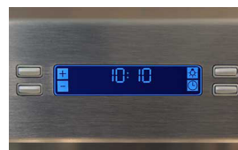
Multi-function electronic controls with LCD display