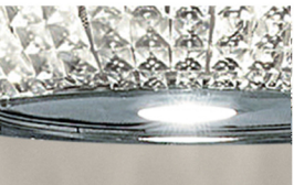
Halogen Lamps & Incandescent Ambient Lamps