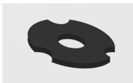
Aluminium Mesh Grease Filter & Long Life Carbon Filter