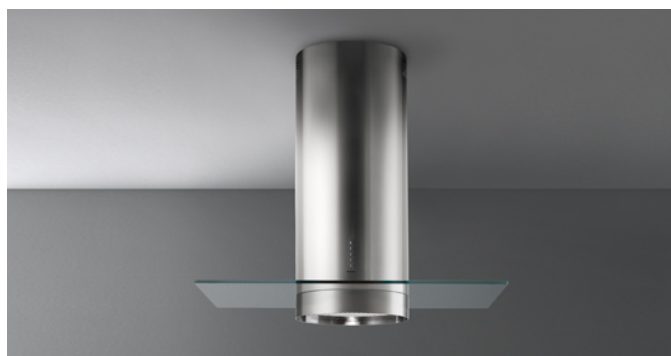
Photograph is for information purposes only May not correspond to the selected version