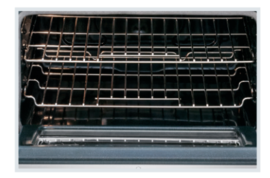
One-Touch Self-Clean Your oven cleans itself — so you don't have to. Self-clean options available in 2-, 3- and 4-hour cycles.