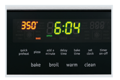
Quick Preheat Preheat in just a few minutes!