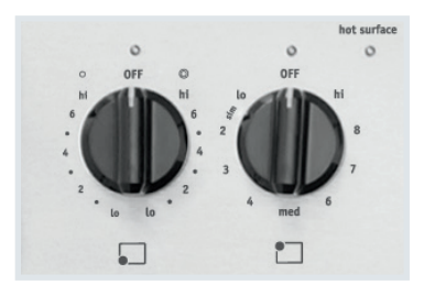
Express-Select® Controls Easily go from warm to boil.