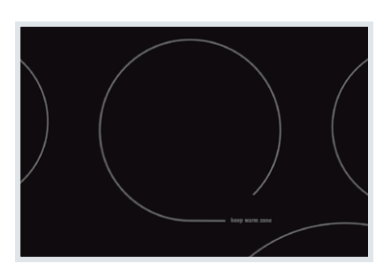
Keep Warm Zone Keep food warm until everything and everyone - is ready