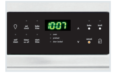
Auto Shut-Off As an extra safety measure, the oven will automatically shut off after 12 hours.