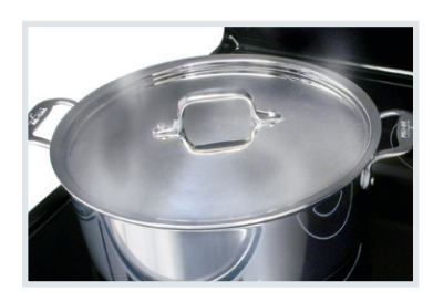
Quick Boil Get meals on the table faster with the quick boil 3000W element.