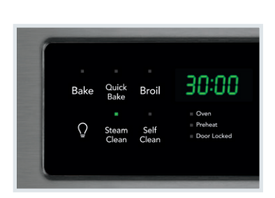
Steam Cleaning A 30-minute light oven cleaning that's chemical-free, odour-free, and fast.