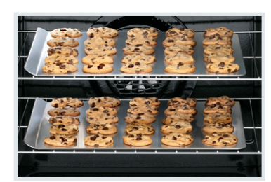
Quick Bake Convection Bake faster and more evenly with Quick Bake Convection.