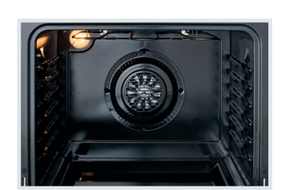
One-Touch Self-Clean Your oven cleans itself - so you don't have to. Self clean options available in 2-, 3- and 4-hour cycles.