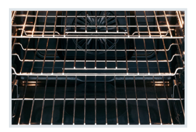
Quick Clean For a quick, light oven cleaning.