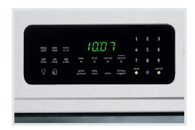
Quick Preheat Preheat in just a few minutes.1