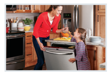
Smudge-Proof™ Stainless Steel Resists fingerprints and smudges so it's easy to clean.