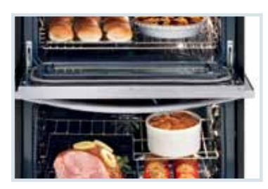
Fits-More™ Double Oven Range A second 2.3 cu. ft. oven gives you more space to cook multiple dishes at the same time.