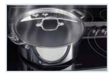
Quick Boil Boils water faster.