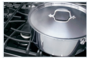
Quick Boil Get meals on the table faster with quick boil - water boils faster than the traditional setting.