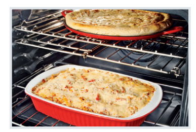
Quick Bake Convention Bake faster and more evenly with Quick Bake Convection.