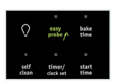
Easy™ Temperature Probe Take the guesswork out of cooking with our temperature probe that shows you the internal cooking temperature of your food.