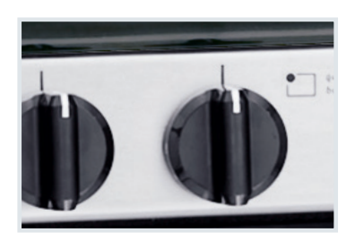
Express-Select® Controls Easily go from warm to boil.