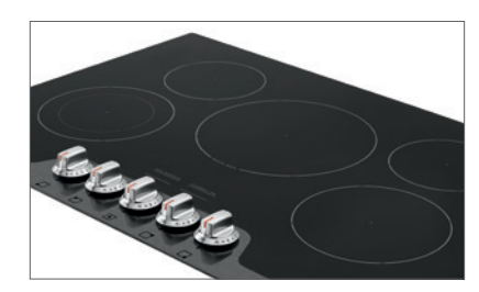
Fits-More™ Cooktop The Fits-More™ cooktop features five elements — allowing you to cook