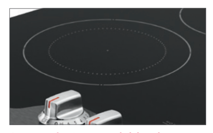
SpaceWise® Expandable Elements Flexible elements expand to your cooking needs.