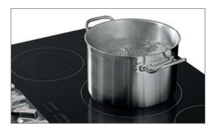
Get Cooking Faster with Quick Boil Our powerful 3,200-watt element allows you to boils water in less than three minutes!