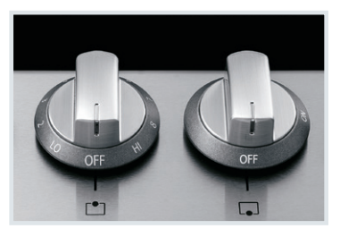
PrecisionPro Controls™ Prepare a range of dishes with precision, whether you're simmering, sautéing, searing or boiling.