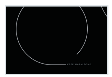
Keep Warm Zone Consistently keep dishes warm while the rest finish for delicous results, every day.