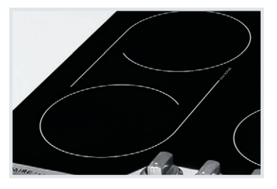
SpacePro™ Bridge Element 2-in-1 cooktop element offers endless meal options. Cook two separate dishes at once, or combine two elements into one for large pots or griddle use.