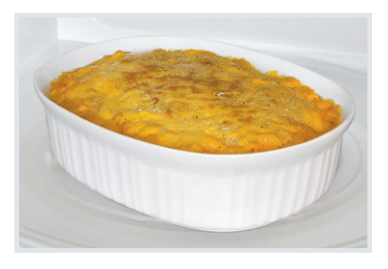
Fits-More™ Microwave Oven Extra-large microwave provides 2.0 cu. ft. of cooking space.