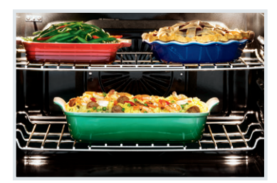
True Convection Single convection fan circulates hot air throughout the oven for faster and more even multi-rack baking