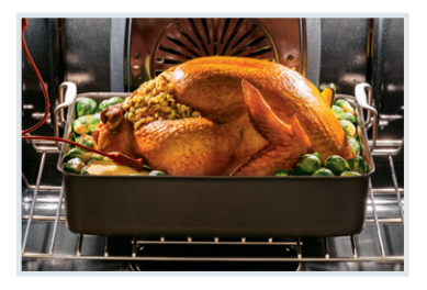
Effortless<sup>™</sup> Convection Takes the guesswork out of convection cooking — our oven automatically adjusts standard baking temperatures to convection temperatures for consistent results.