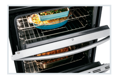
Symmetry™ Double Ovens Cook multiple dishes, at different temperatures, all at one time, with Symmetry™ Double Ovens.