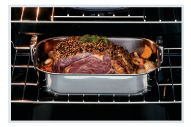
PowerPlus<sup>®</sup> Convection Powerful performance delivers consistent results. Evenly cooked dishes, every time, with PowerPlus<sup>®</sup> Dual-Fan Convection Bake and Roast.