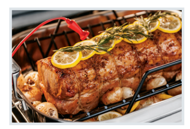
PowerPlus® Temperature Probe Ensures great results the first time. Set and monitor dish temperature with the PowerPlus® Temperature Probe.