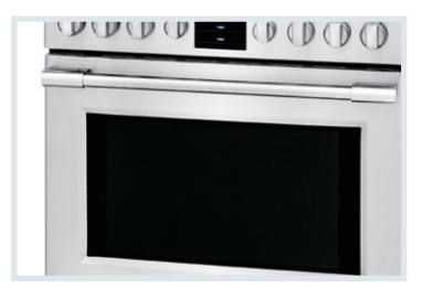
Smudge-Proof™ Resists fingerprints and cleans easily.