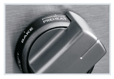
PowerPlus® Preheat With PowerPlus® Preheat, your oven is ready in a few minutes for a powerful start to every delicious meal.