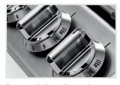
Express-Select® Controls Easily go from warm to boil.

Continuous grates make it easy to move heavy pots and pans between burners without lifting.