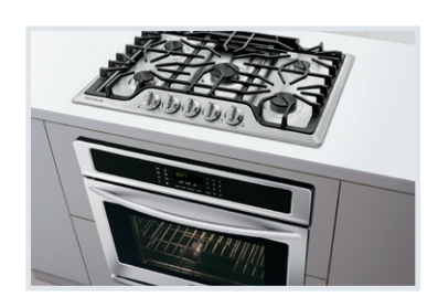
Approved Over Frigidaire® Electric Wall Ovens

Cooktops are approved for installation above any of our Single Electric Wall Ovens.