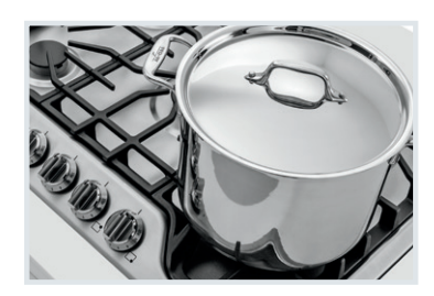
Power Burner Power Burner offers more power and faster boil time.