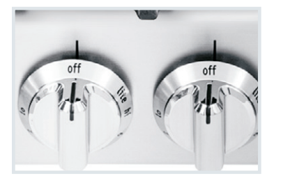
Express-Select® Controls Easily go from warm to boil.