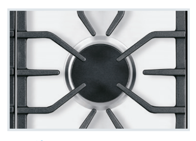
Low Simmer Burner Perfect for delicate foods and sauces.

Continuous grates make it easy to move heavy pots and pans between burners without lifting.