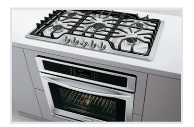
Approved Over Frigidaire® Electric Wall Ovens Cooktops are approved for installation above any of our Single Electric Wall Ovens.