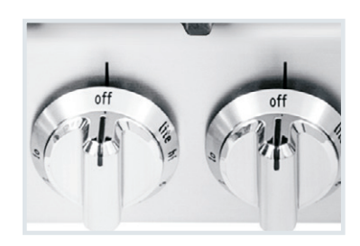
Express-Select® Controls Easily go from warm to boil.