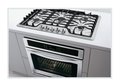
Approved Over Frigidaire® Electric Wall Ovens Cooktops are approved for insta

Cooktops are approved for installation above any of our Single Electric Wall Ovens.