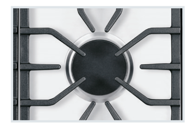
Low Simmer Burner Perfect for delicate foods and sauces.

Continuous grates make it easy to move heavy pots and pans between burners without lifting.