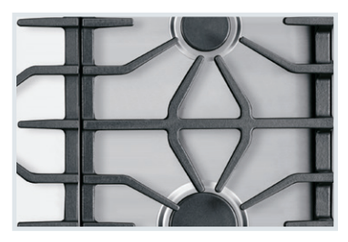
Continuous Grates Continuous grates make it easy to move heavy pots and pans between burners without lifting.