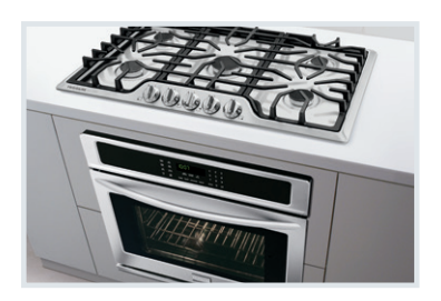
Approved Over Frigidaire® Electric Wall Ovens Cooktops are approved for installation above any of our Single Electric Wall Ovens.