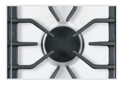
Low Simmer Burner Perfect for delicate foods and sauces.