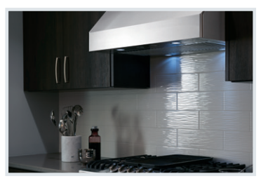
PowerBright™ LED Cooktop Lighting

Clear, bright view of your cooktop workspace with LED lighting for seamless meal preparation. Offers 3 different brightness levels.