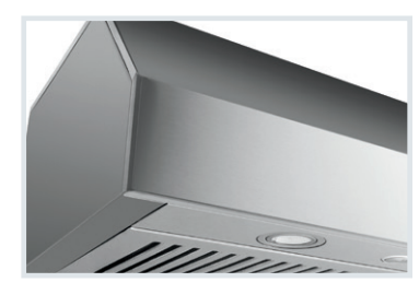
Smudge-Proof<sup>™</sup> Resists fingerprints and cleans easily.