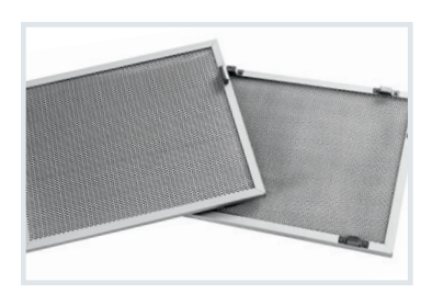
Dishwasher-Safe Filters For consistently clean air circulation, use our removable, dishwasher safe filters.