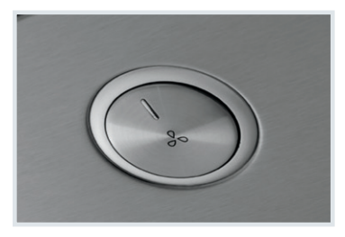
PowerPlus® 3-Speed Fan Powerful airflow at 3 different speeds — quietly moves up to 400 cu. ft. of air per minute.