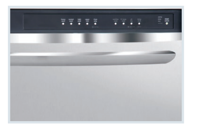
Quietest Dishwasher in Its Class<sup>1</sup> A quiet performance every time.