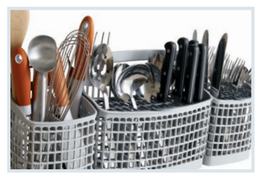
Largest Silverware Basket<sup>3</sup> There's room for over 180 items in our multicompartment silverware basket.