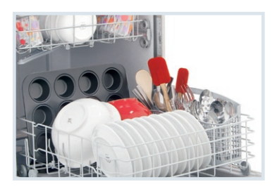
SpaceWise™ Organization System Our SpaceWise™ Organization system features adjustable racks and the Largest Silverware Basket<sup>3</sup> so there's a place for virtually anything.