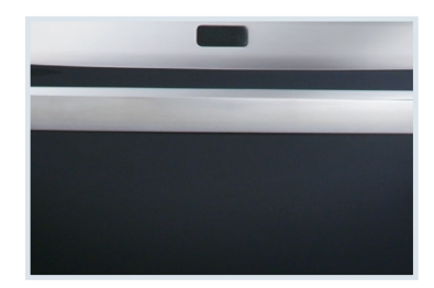
Quietest Dishwasher in Its Class<sup>1</sup> A quiet performance every time.