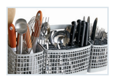
Largest Silverware Basket<sup>3</sup> There's room for over 180 items in our multicompartment silverware basket.