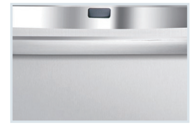
Quietest Dishwasher in Its Class<sup>2</sup>

Our SpaceWise™ Organization system features adjustable racks and the Largest Silverware Basket³ so there's a place for virtually anything.