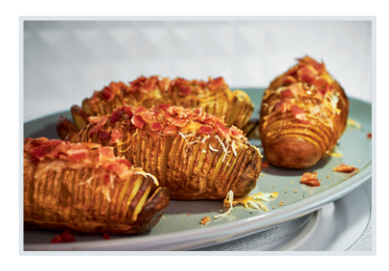
Sensor Cooking Microwave automatically adjusts power levels and cooking times to cook a variety of items, effortlessly.