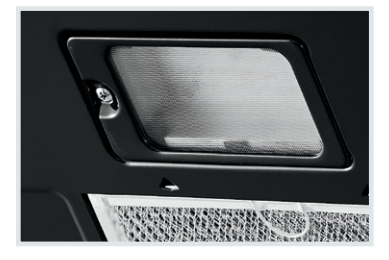
LED Cooktop Lighting Make meal preparation and cooking simple with LED lighting that offers a clear, bright view of your cooktop.