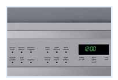
Over 40 Options Versatile settings include: chicken nuggets, soften ice cream, melt butter and multiple snack options.