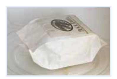
One-Touch Options Our microwaves feature easy-to-use one-touch buttons so you can cook chicken nuggets, baked potatoes or popcorn with the touch of a button.