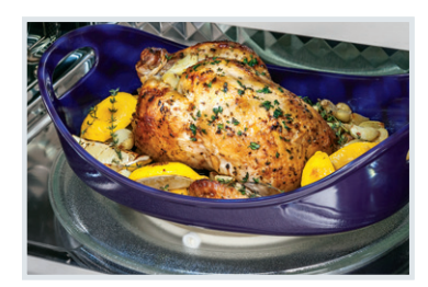
PowerSense<sup>™</sup> Cooking Technology Results you can trust. PowerSense<sup>™</sup>

Cooking Technology automatically senses ideal time and power levels.