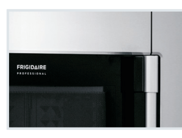
Smudge-Proof<sup>™</sup> Stainless Steel Resists fingerprints and cleans easily.