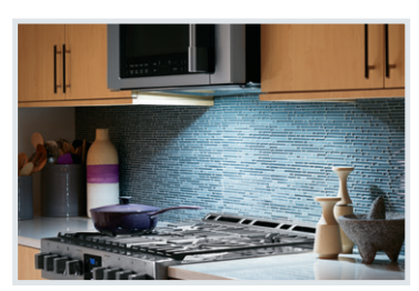
PowerBright™ Cooktop LED Light Make meal preparation and cooking simple with LED lighting that offers a

Cooking Technology automatically senses ideal time and power levels.