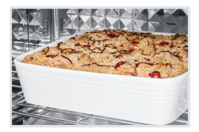
2-In-1 Convection Oven or Microwave Bake more evenly with PowerPlus™ Convection or cook at microwave speed. all-in-one.