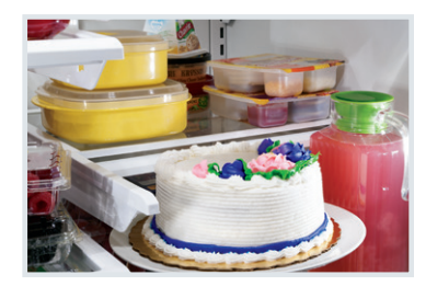
SpillSafe® Flip-Up & Slide-Under Shelves Easily make room for tall or large items

Easily make room for tall or large items with the new Flip-Up and Slide-Under shelves.