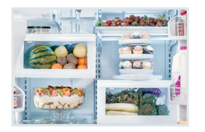
Adjustable Interior Storage Over 100 ways to organize and customize your refrigerator.