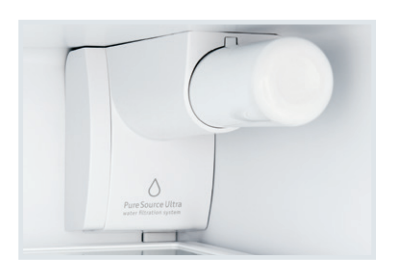
PureSource Ultra® Ice & Water Filtration Discover how our genuine filtration works to keep your water cleaner.