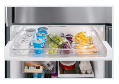
Store-More™ Drawer Keep snacks like yogurt, cheese, and juice boxes easily accessible for grab-and-go access.