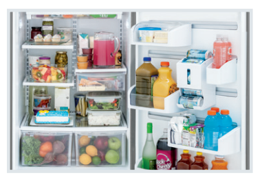
Over 100 Ways to Organize Our SpaceWise® Organization System offers 100 ways to organize with the Custom-Flex™ Door and Store-More™ Drawer!