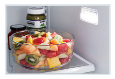
Bright LED Lighting Find food faster with bright LED lighting.

The Custom-Flex™ Door comes with 6 different bins and accessories so you can customize your door. It includes the 12 oz. can dispenser, mini bin, dairy bin, and a large, medium and small bin.