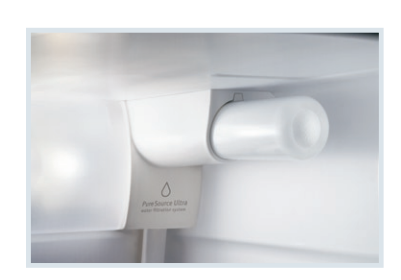
Best-in-Class Ice & Water Filtration<sup>2</sup> PureSource Ultra™ Water Filtration offers best-in-class water filtration so you get cleaner, better-tasting water at your fingertips.