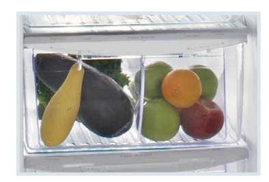
Largest Crisper Drawers <sup>1</sup> Store more in our largest capacity crisper drawers.