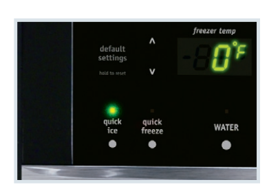
Quick Ice <sup>3</sup> Quick Ice delivers up to 37 percent more ice.

Our SpaceWise™ organization system makes it easy to keep food organized and easy to find when you need it.