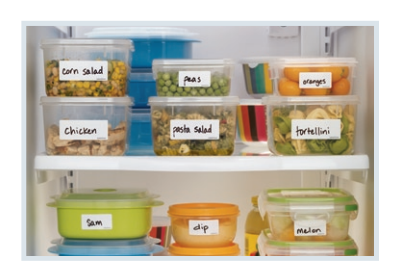
SpaceWise™ Organization System

Our SpaceWise™ organization system makes it easy to keep food organized and easy to find when you need it.