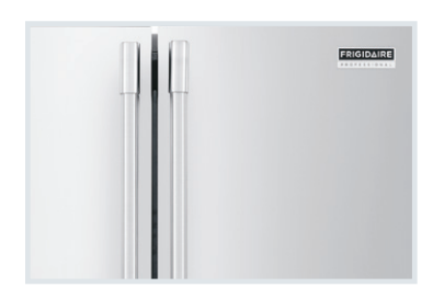
Smudge-Proof™ Stainless Steel Resists fingerprints and cleans easily.

Fresh air offers great taste. PureAir® Filtration removes up to 7 times more odour than baking soda to keep ingredients tasting fresh by removing odour particles with fast-acting, highly absorbent carbon technology.¹