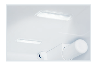
Multi-Level LED Lighting Corner-to-corner LED lighting throughout the refrigerator for better visibility.

Over 100 ways to organize and customize your refrigerator.