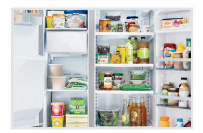
Adjustable Interior Storage

Over 100 ways to organize and customize your refrigerator.