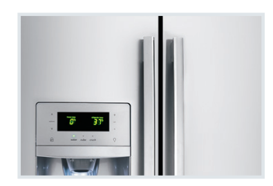
Smudge-Proof™ Stainless Steel Reduces fingerprints and smudges so it's easy to clean.

PureSource Ultra® Water Filtration offers best-in-class water filtration so you get cleaner, better tasting water at your fingertips.