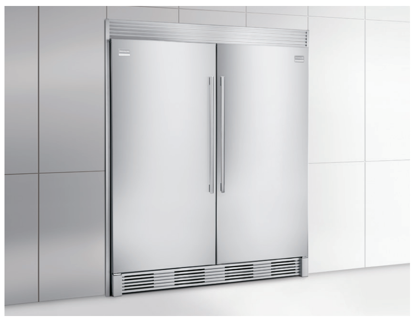
Shown with companion, All-Freezer model FPFU19F8QF and optional coordinated Double Louvered Trim Kit (TRIMKITEZ2).