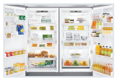
SpacePro<sup>™</sup> Shelving System Offers quick access to fresh ingredients with organizational solutions designed for space optimization including SpacePro<sup>™</sup> Door Bins, SpacePro<sup>™</sup> Crisper Bins and