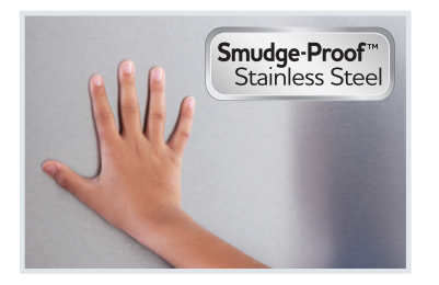
Smudge-Proof™ Stainless Steel Resists fingerprints and cleans easily.

PureAir® Filtration System Fresh air offers great taste. PureAir® Filtration removes up to 7 times more odour than baking soda to keep ingredients tasting fresh by removing odour particles with fast-acting, highly absorbent carbon technology.<sup>1</sup>