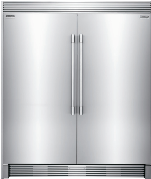
Shown with companion, All-Freezer model FPFU19F8RF and optional coordinated Dual 75" Louvered Trim Kit (TRIMKITEZ2).