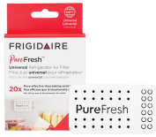
FRPFUAF1 PureFresh™ Universal Air Filter