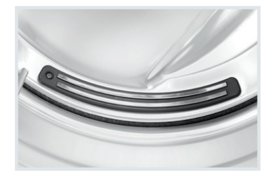
DrySense™ Technology Dries your clothes more precisely, reducing wrinkles.