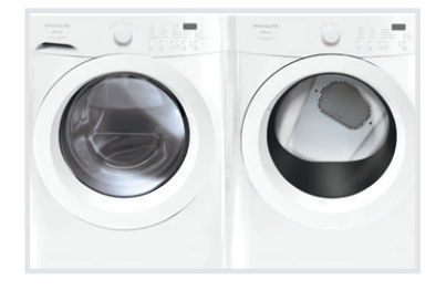
TimeWise® Technology TimeWise® Technology ensures wash time equals dry time — so you don't wait for clothes to dry.