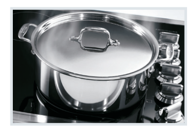
Quick Boil Boils water faster.