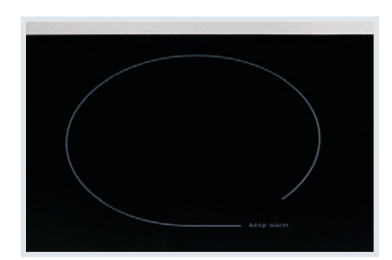
Keep Warm Zone Keep food warm until everything—and everyone—is ready.