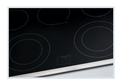
SpaceWise® Expandable Elements Flexible elements expand to your cooking needs.