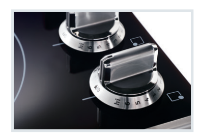
Express-Select® Controls Easily go from warm to boil.