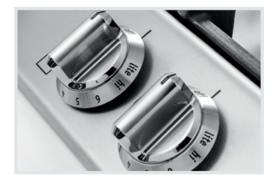
Express-Select® Controls Easily go from warm to boil.

Continuous grates make it easy to move heavy pots and pans between burners without lifting.