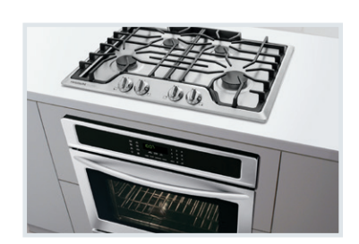
Approved Over Frigidaire® Electric Wall Ovens

Cooktops are approved for installation above any of our Single Electric Wall Ovens