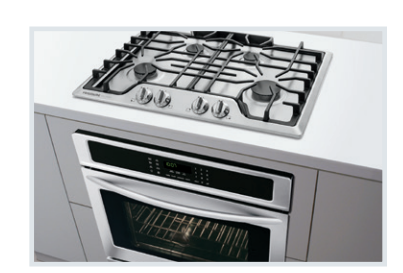
Approved Over Frigidaire® Electric Wall Ovens Cooktops are approved for installation above any of our Single Electric Wall