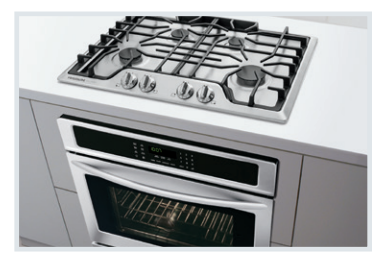
Approved Over Frigidaire® Electric Wall Ovens Cooktops are approved for installation above any of our Single Electric Wall Ovens.