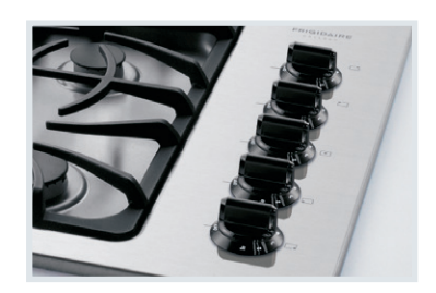
Express-Select® Controls Easily go from warm to boil.