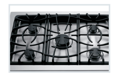
Fits-More™ Cooktop The Fits-More™ cooktop features five burners so you can cook more at once.