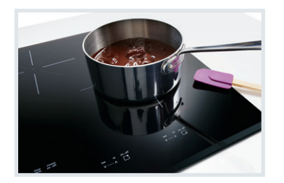
Exceptional Temperature Control Adjust heat with greater accuracy than on gas or electric cooktops especially at lower settings.