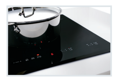
More Energy-Efficient Cooking with induction is 70% more efficient than gas and 20% more efficient than electric.