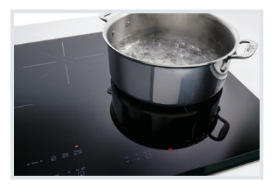
More Responsive Cooking with induction is more responsive than gas or electric so you can easily go from simmer to boil.