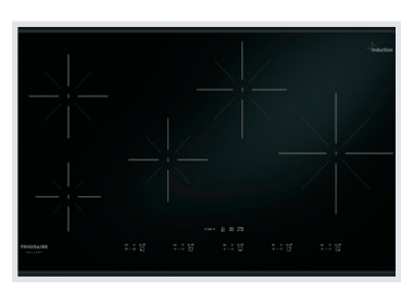
Versatile Induction Elements With up to five powerfully efficient induction elements, the Induction Cooktop offers the superior cooking flexibility. And the 10" induction element offers up to 3,400 watts of power, so you can bring water to a boil quickly.