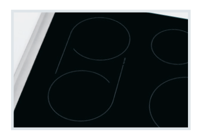
SpaceWise® Bridge Element A flexible element lets you combine two elements into one to fit larger cookware.