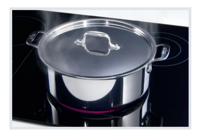
PowerPlus® Boil Boil water fast.