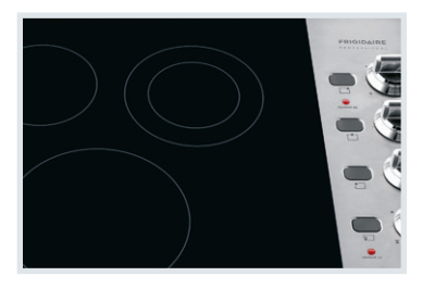
SpaceWise® Expandable Elements Flexible elements expand to your cooking needs.