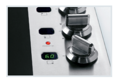
Pro-Select® Controls Precise control at your fingertips.