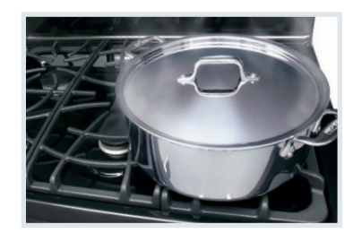
PowerPlus® Boil Boil water fast.