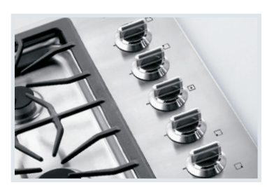
Pro-Select® Controls Precise control at your fingertips.