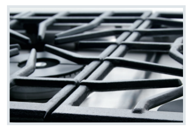
Continuous Grates Continuous grates make it easy to move heavy pots and pans between burners without lifting.