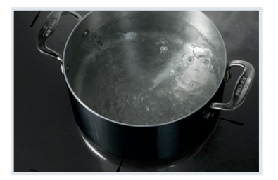
Maximize Your Time PowerPlus™ Induction Technology boils water in less than 2 minutes so you can shave time off of cooking dinner every day.<sup>1</sup>