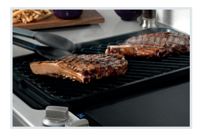
Flexible Cooking SpacePro<sup>™</sup> Bridge Element allows you to cook two separate dishes at once, or combine elements for large pots or griddle use. The cooktop adapts to the size of the pan whether it's a small pot, a large frying pan or a griddle.