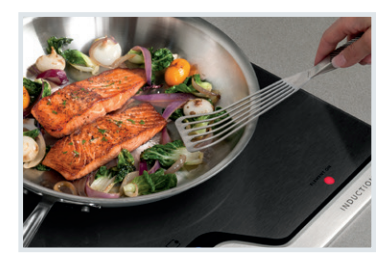
Consistent Results Even heat eliminates hot spots and delivers consistent results for creating delicious, evenly cooked foods like steaks and omelettes.

Our PowerPlus<sup>™</sup> Induction Cooktop offers the the speed, control and consistency of gas, without requiring the converting of your kitchen from electric to gas.