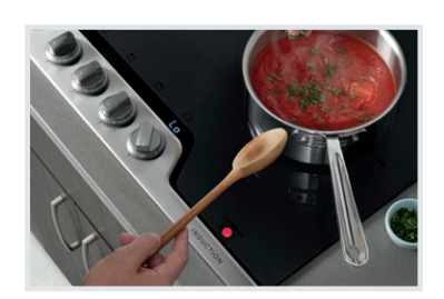
Gas Benefits, Without the Remodel

Our PowerPlus<sup>™</sup> Induction Cooktop offers the the speed, control and consistency of gas, without requiring the converting of your kitchen from electric to gas.