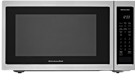
Stainless Steel KMCC5015GSS